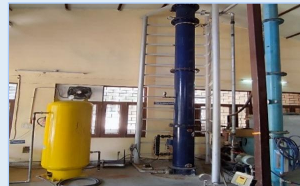
Biogas enrichment and bottling facility at IITD