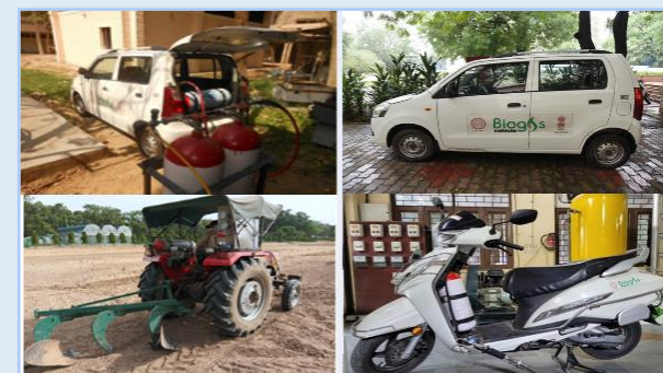
CBG driven car, tractor & two-wheeler at IITD